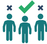
Pre-Selection/Approved Selection Criteria: Police/Health Checks