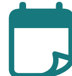
Traineeship Program Commencement