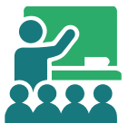
Class Training 3 weeks