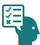
Pre-Training Suitability: Learning Assessment